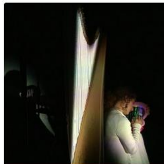
Instruments and Electronics