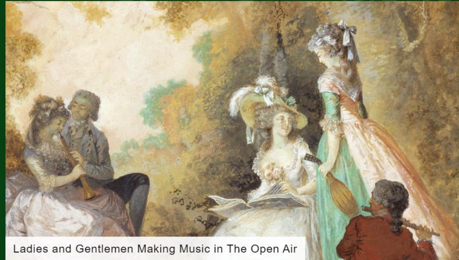
Ladies and Gentlemen Making Music in The Open Air