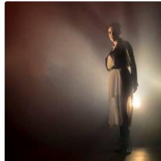
Music and Scene